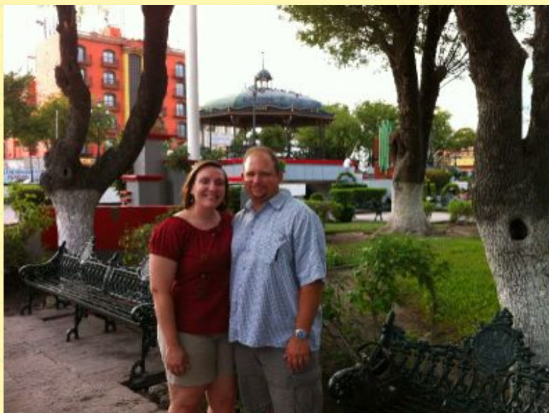
Class field trip to Mexico

preparing us for being able to answer questions about God and His Word.