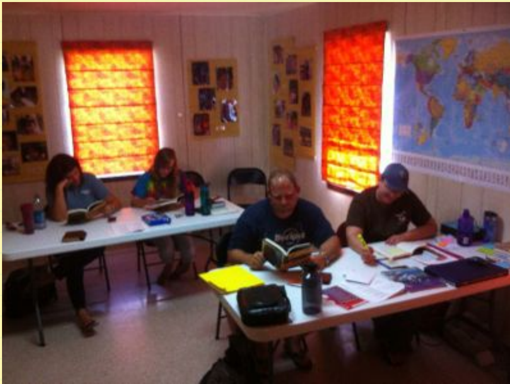
Diligently studying in the classroom